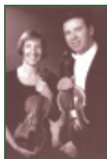
Enjoy the classics with the Tijeras Trio

Date: Saturday, October 8, 2005 Location: Mission Viejo City Hall Time: 6:30 p.m. Fee: Free